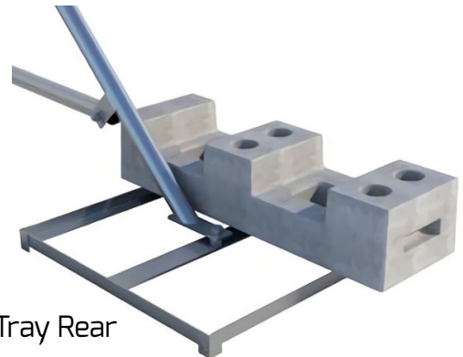
Block Tray Rear