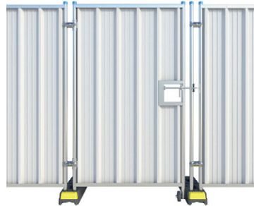
Single Swing Gate