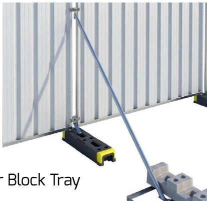
Stabilizer Block Tray