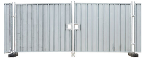
Double Swing Gate